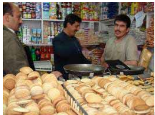
A MISFA SME Client in Northern Afghanistan

Commercial Banks Receive Extensive Technical Assistance in SME Lending: On August 25, the USAID-founded Small and Medium Enterprise (SME) Lending Department at the Microfinance Investment Support Facility for Afghanistan (MISFA) completed report cards as part of its technical assistance program to Afghanistan International Bank (AIB), the First Microfinance Bank (FMFB), and Bank Alfalah. The report cards are designed to assess the institutions' lending capacity in general and their potential risks in particular. This activity is carried out semiannually and followed by a set of recommendations including next steps for improvement. ARIES extends up to US$15 million loan capital through MISFA for SME lending in the Alternative Development Program (ADP) regions. The assistance package to SME lending partners includes classroom trainings, extensive mentoring services, and policy and procedure development. To date, the MISFA SME partners have disbursed a cumulative number of 775 loans in the total amount of US$22.3 million.