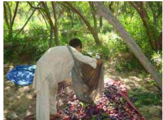
A USAID-Funded Client in Kandahar Province

Under the Agriculture, Rural Investment and Enterprise Strengthening (ARIES) Program, the USAID Mission in Afghanistan supports 11 financial service outlets, providing access to nearly 7,000 active clients (savers and borrowers) in the underserved provinces and districts of the south. The region is not only the biggest producer of illicit drugs but it is also one of the insecure and instable areas of the country. Access to credit contributes to the overall initiatives in providing alternative livelihoods to poppy growers and will have an impact on the overall security and stability of the region.